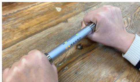
Figure 1 The MyDiagnostick® medical device.

The Screening of Atrial Fibrillation among Elderly in Primary Care with MyDiagnoSTick (SAFEST) study uses a device (MyDiagnostick®, MyDiagnostick Medical B.V. Maastricht, The Netherlands) (Figure 1) for opportunistic screening of AF in an elderly population. SAFEST is a cross-sectional,